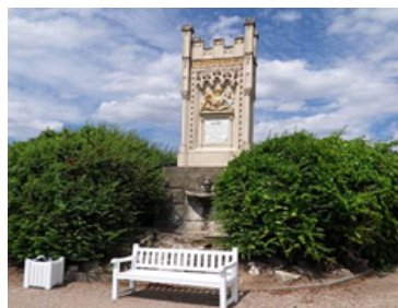
Queen Victoria Monument in Hochheim

Künstler are based in Hochheim, a wine village in the Rheingau with south facing slopes going down to the Main river 3 km before its confluence with the rhine. The Hölle (sloping hillside) vineyard incorporates the Königin-Viktoria-Berg, which Her Majesty visited in 1845 and in 1851 granted permission to name the vineyard after her.