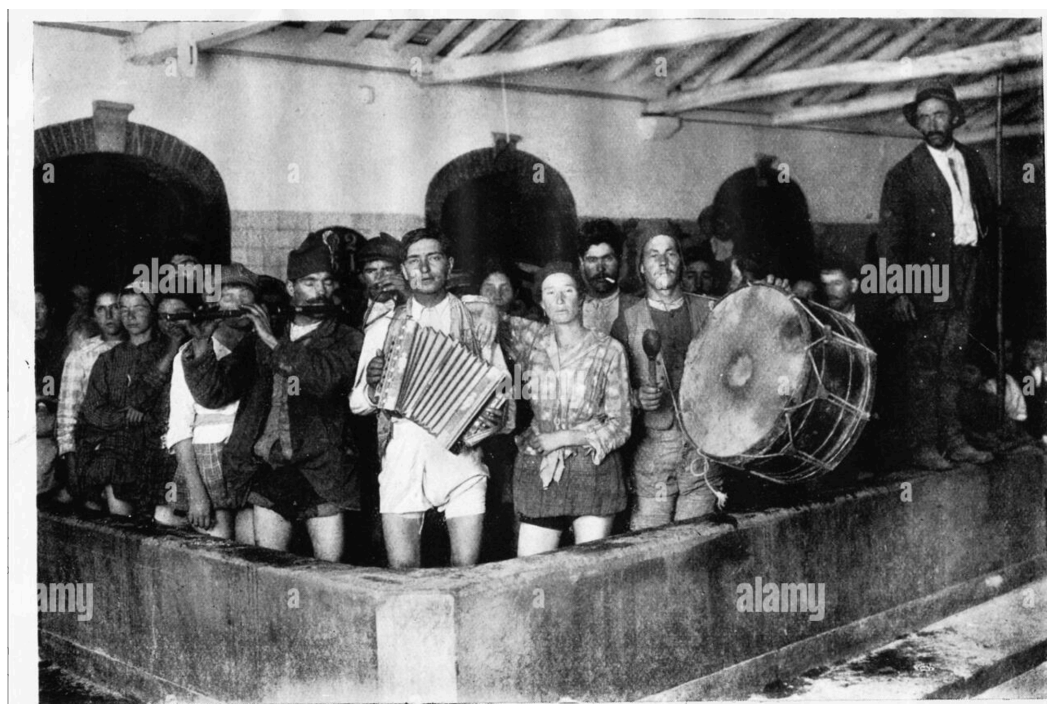
FEET AND LEGS WASHED SCRUPULOUSLY CLEAN, THE WINE-TREADERS OF THE ALTO DOURO LIGHTEN THEIR TOIL WITH MUSIC OF FIFE, DRUM AND ACCORDION.

Crafted using sustainably grown fruit, grapes are foot-trodden in traditional cement tanks and then aged in oak barrels. This 2008 vintage is a pure expression of the estate's slopey, riverside terroir, with opulent notes of cassis, black cherry, dark chocolate and sandalwood.